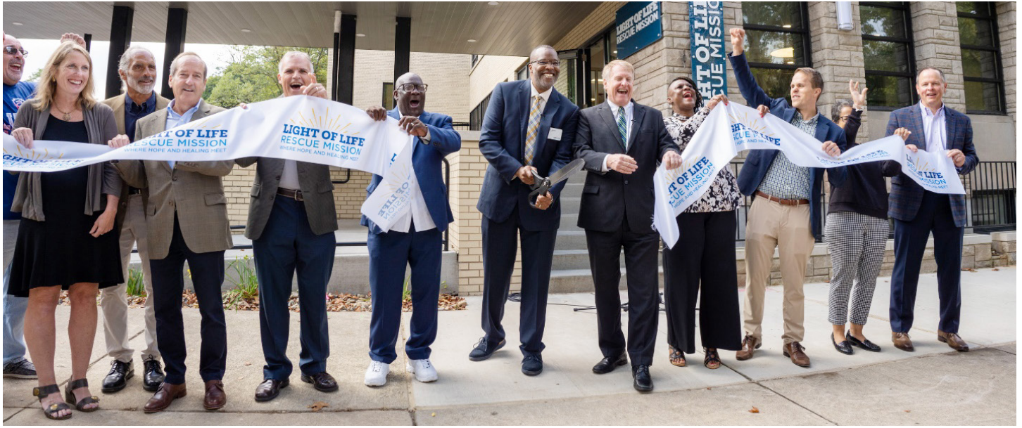
Light of Life Ribbon Cutting for Ridge Recovery Place, the Mission's new home for its long-term recovery programs, donation center, and administrative offices.

Center for Victims, , Sojourner House, Light of Life, and Homeless Children's Education Fund for dedicating new facilities to better serve their clients. Center for Victims opened a world-class shelter for victims of domestic violence at its main office on the South Side. The shelter includes an interactive exhibit on trauma, canine advocates, and a program connecting clients with professionals who are working toward communities free of violence and crime.