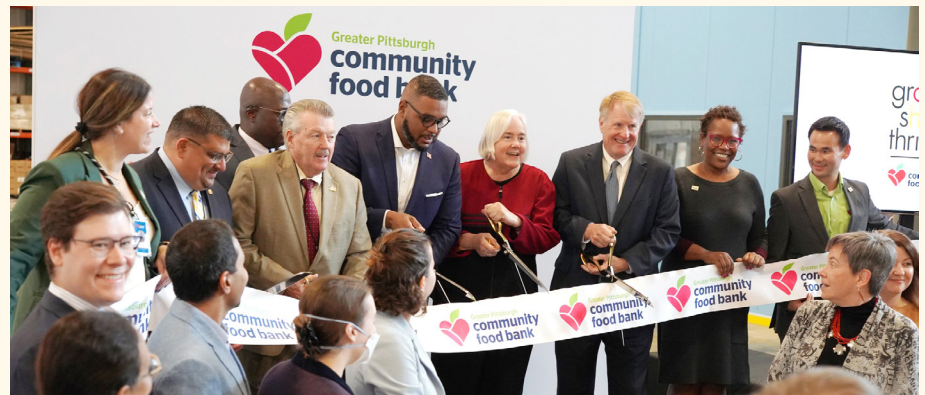
Greater Pittsburgh Community Food Bank celebrates its nearly 30,000 square foot expansion and renovation project by hosting a VIP celebration and ribbon cutting event.

► Beverly's Birthdays , believing that all children are worth celebrating, provides birthday cheer in shelters for children experiencing homelessness.