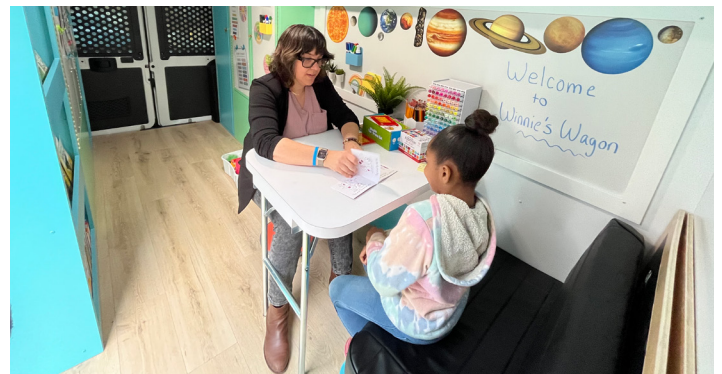
An educator tutors a student in Winnie's Wagon mobile learning unit.

More than 200 community leaders, elected officials, staff, clients, and former clients attended the Light of Life ribbon cutting of Ridge Recovery Place on the North Side. The new 53,000 square foot facilities is a result of a successful $24-million capital campaign.