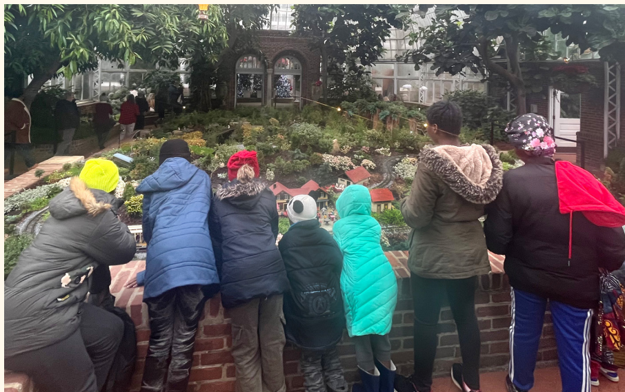
Tickets for Kids enables children experiencing homelessness and living in shelters to enjoy cultural events and activities.

► Jeremiah's Place provides free emergency childcare for children ages birth to age 6.