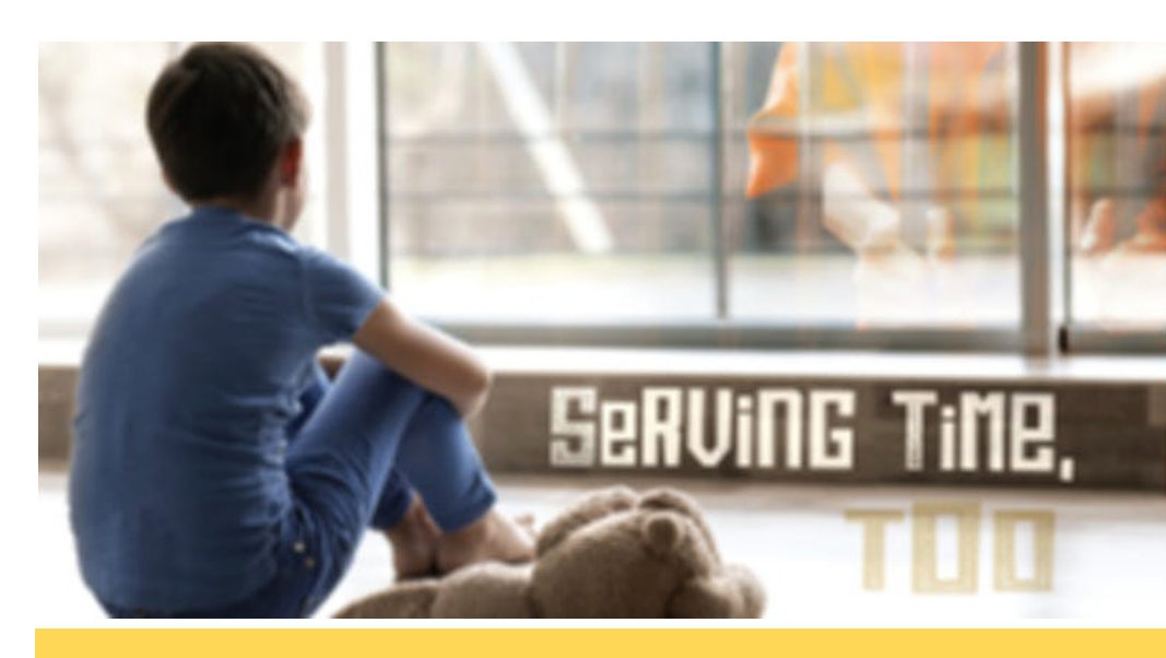
On May 23, WQED-TV will air Serving Time, Too at 8 p.m. followed by Children of Incarcerated Parents: A Community Forum at 8:30 p.m.

For more than a decade, PCGF focused its efforts on an initiative to address the needs of children whose parents were incarcerated. In addition to providing the seed money to establish Amachi Pittsburgh, the Foundation continues to address this issue by partnering with the Allegheny County Department of Human Services and other grantmakers. The Foundation's website offers several reports and resources on the subject. PCGF provides copies of its "Family Ties" DVD, a candid conversation with six fathers incarcerated in the Allegheny County Jail who reflect on their love for their children and how their behaviors have impacted their most cherished relationships.