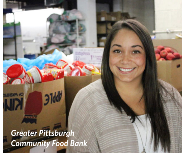
Greater Pittsburgh Community Food Bank

Homeless Children's Education Fund served 450 children through after-school programming, summer programming and enrichment programming in partnership with shelters and transitional housing organizations. Programming helped students to build relationships and improve